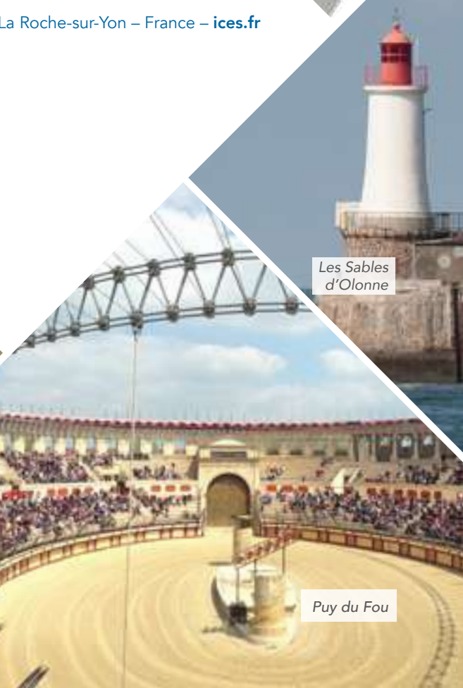
Les Sables d'Olonne